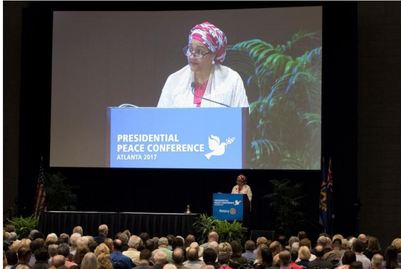
Amina J. Mohammed, deputy secretary-general for the United Nations, spoke to attendees at Presidential Peace Conference, 10 June