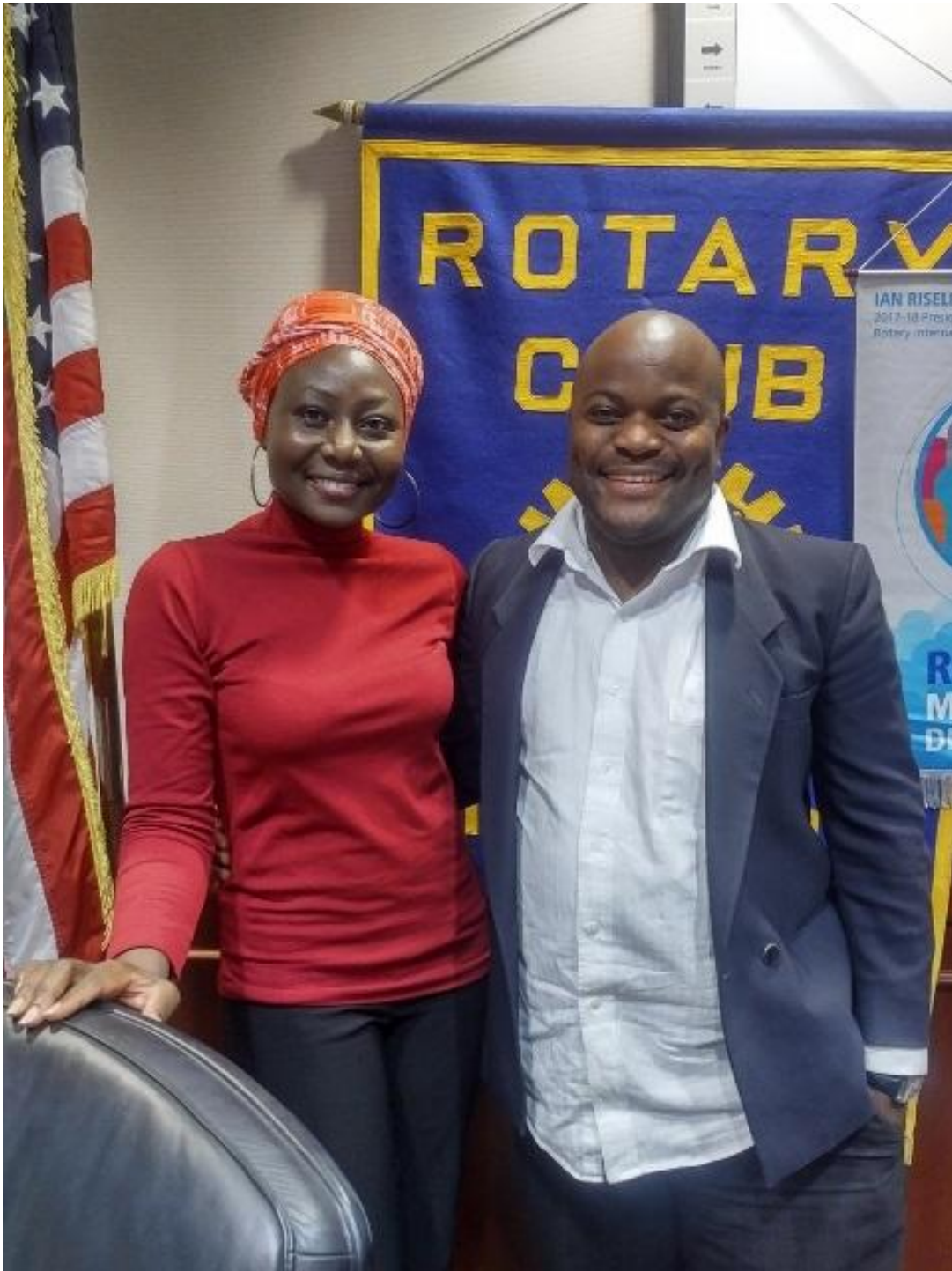
Guests at the last Malibu Rotary Club Meeting