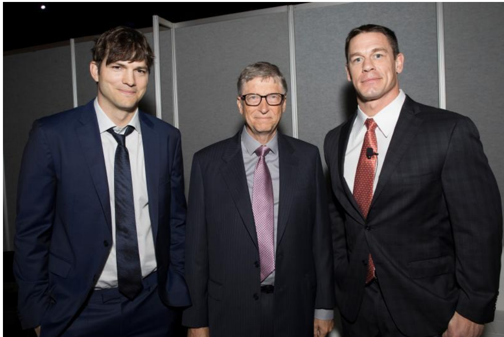
Three great philanthropists took the stage at the general session, 12 June: (from left) Ashton Kutcher, Bill Gates, and John Cena.