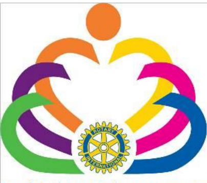
Reach Within to Embrace Humanity