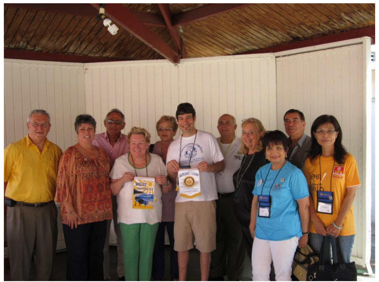
With matching grants from The Rotary Foundation, Rotary District 5280 (District