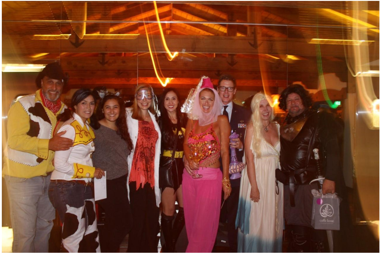
Winners of the 2017 Malibu Rotary Club Halloween Fund Raiser Costume Contest