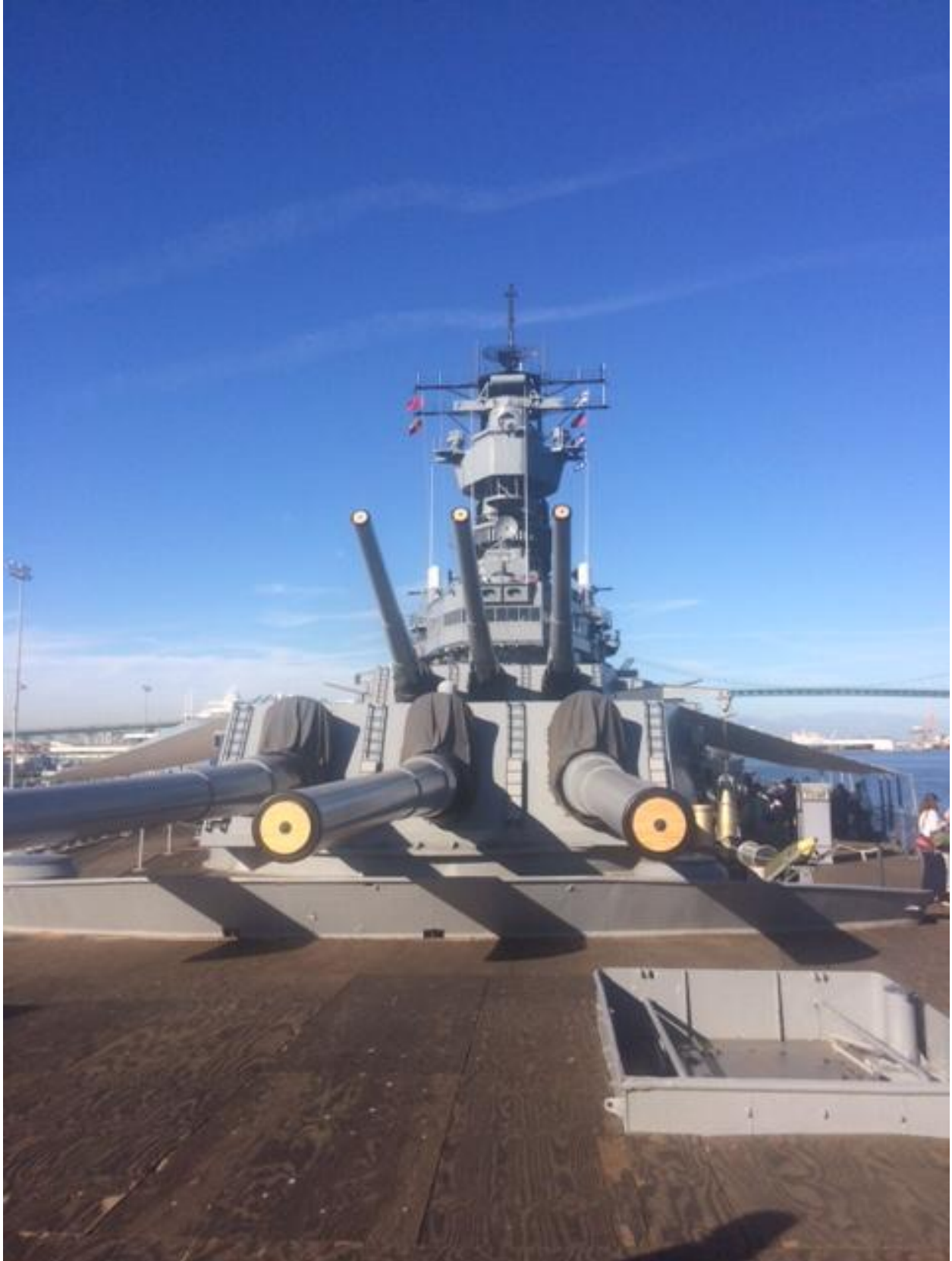
USS Iowa Cannons