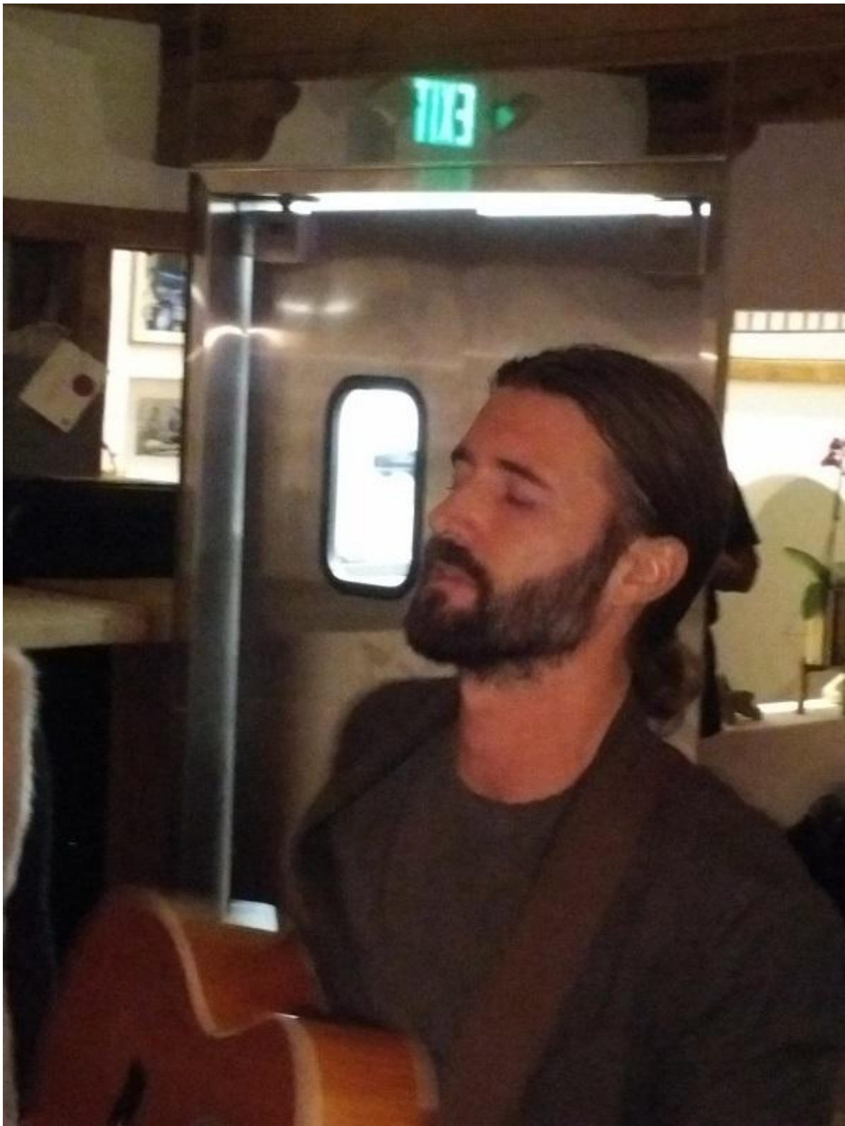
Brandon Jenner Sings an original ballad at the Malibu Rotary Club Halloween FundRaiser on October 27