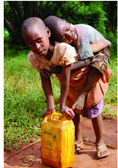
The average African family survives on 5 gallons of water a day, which some have to walk for miles to get.