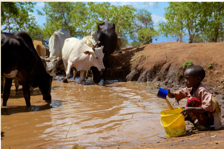
A Nigerien child draws water from a source shared with livestock, which means it will be contaminated with animal waste and potentially dangerous to their family.

World Vision looks forward to another successful partnership with Rotary, one that will change lives for children and families in Torodi. We are grateful to be working alongside Manhattan Beach Rotary and Gaweye Rotary to provide safe water, increased access to sanitation facilities, and improved hygiene—which, when combined, will greatly improve the well-being of those living in this rural, underserved area. Manhattan Beach Rotary's support of $500,000 toward this nearly $1 million dollar project will have an immeasurable return on investment, as every young life is precious beyond value. Imagine the potential that will be unleashed when 25,000 Nigeriens have access to these necessities. No longer waylaid by preventable disease, they will begin to shape their futures and transform their communities. Thank you for collaborating with World Vision to help create a better world for children in Niger.