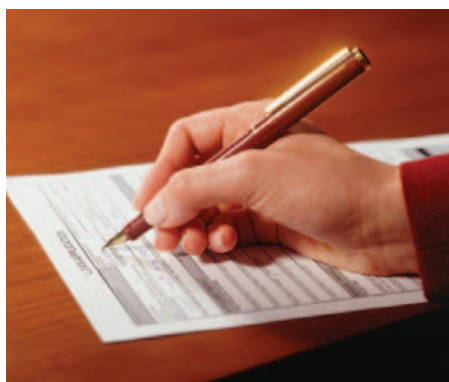
Small-business loans is the topic for the August 23 seminar