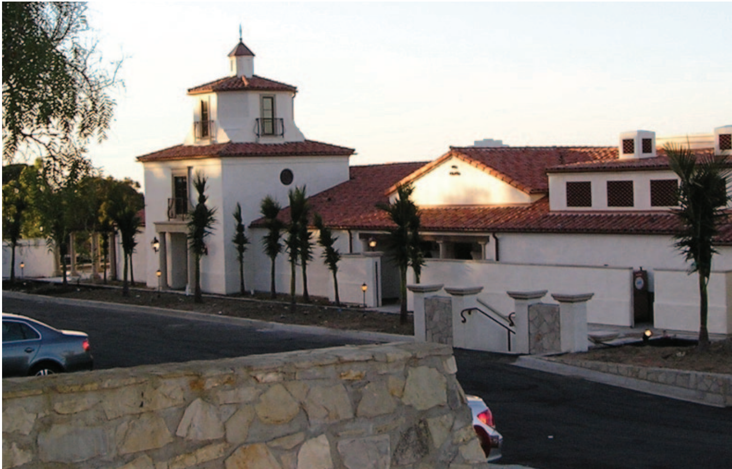
—Palos Verdes Golf and Country Club