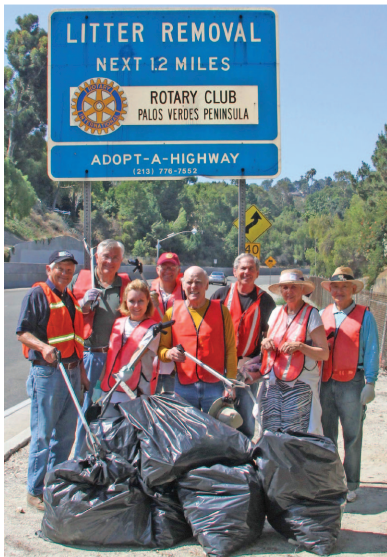
The Crenshaw Crew.