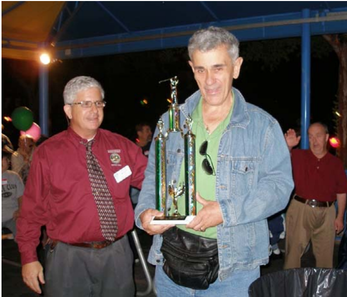
2 nd Place, Men's Division

PolioPlus: Thank you to everyone who contributed to Polio Plus this week.