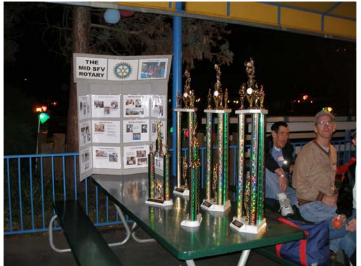
Trophies and a Few Participants