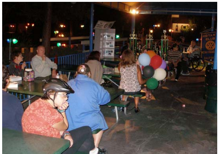
Part of the Expectant Crowd