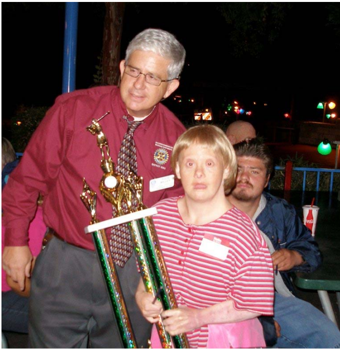
1st Place, Women's Division