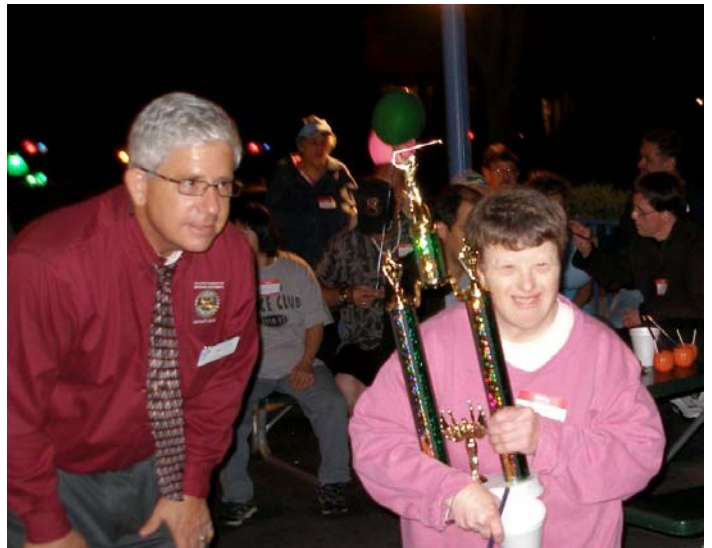
2nd Place, Women's Division (and a few of the pumpkins filled with treat for all the participants)