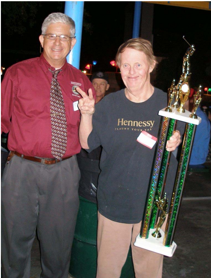
1st Place, Men's Division