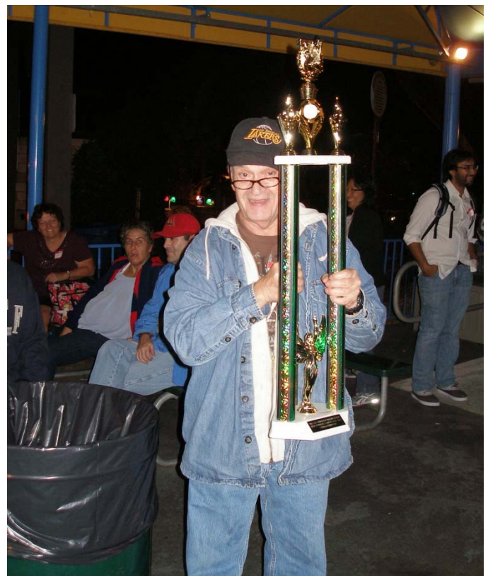
The Grand Prize winner