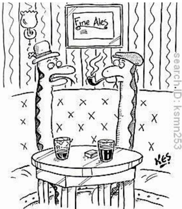
"I was thinking of celebrating St. Patrick's day in the old country, but then I remembered...I have no family left over there."

"We should not write so that it is possible for the reader to understand us, but so that it is impossible for him to misunderstand us." Quintilian (Marcus Fabius Quintilianus), rhetorician (c. 35-100)