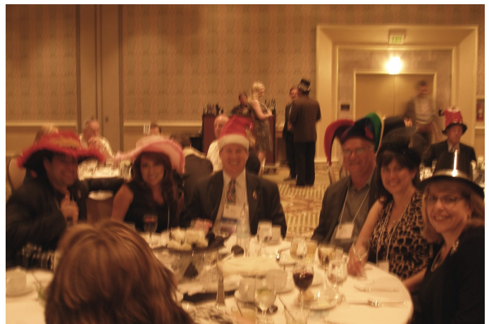
A sampling of funny hats