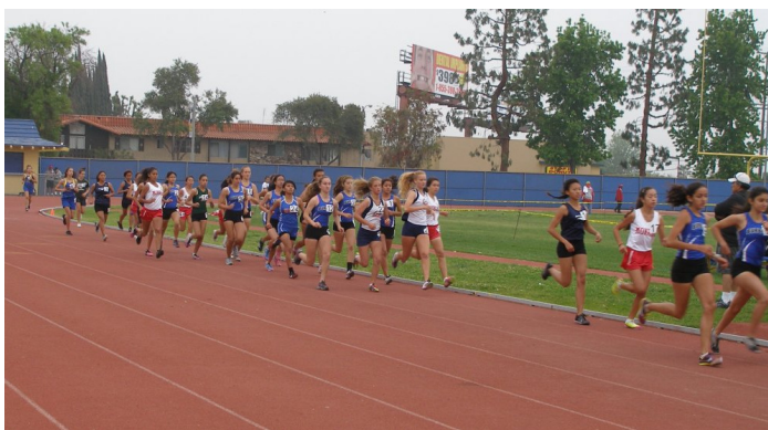
Girls' 500 meter race