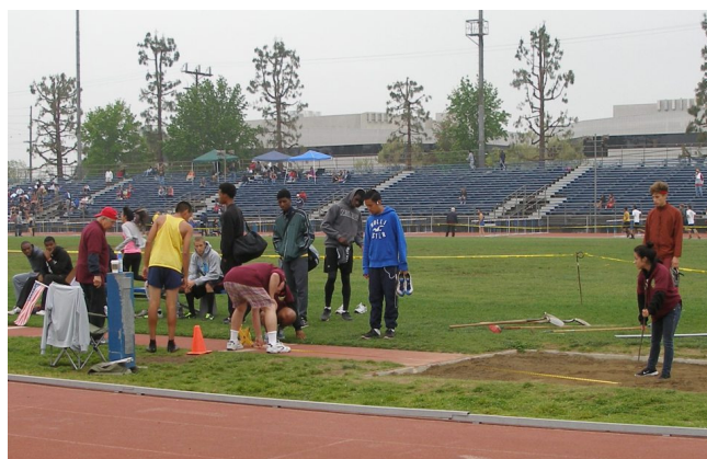
Boys' long jump