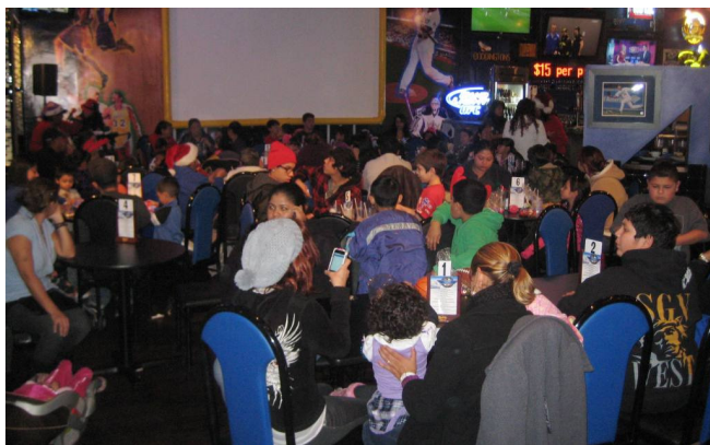
Some of the revelers December 18