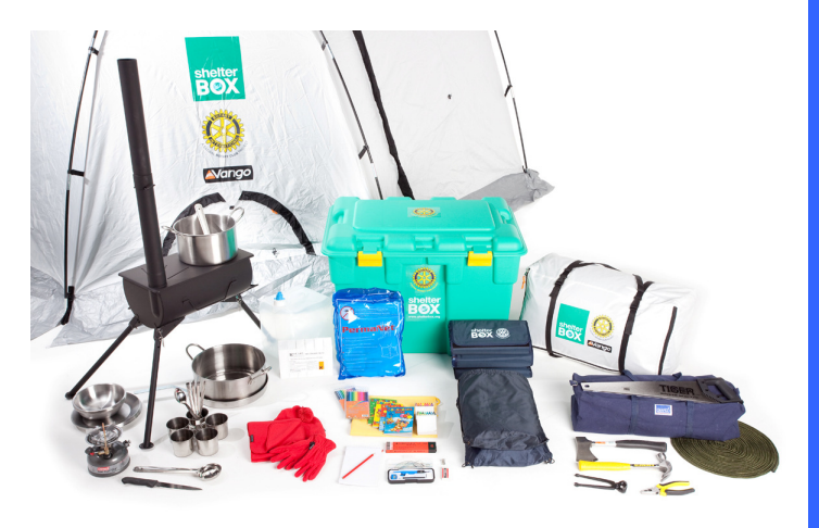
Typical shelter box and supplies

as its millennium project. "Little did they know that it would become the largest Rotary club project in the world, with affiliates in countries across the globe... In 2005, ShelterBox sent out more than 22,000 boxes, almost 10 times the number delivered in the previous three years... (becoming) a major player in the field of international disaster relief."