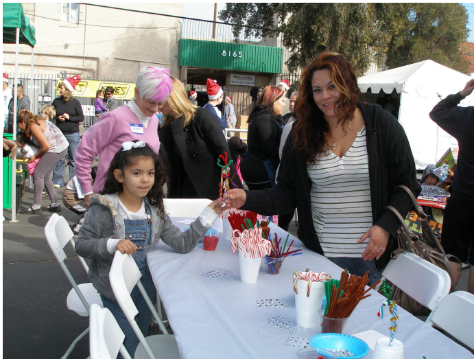
One of our first "customers" and her mom