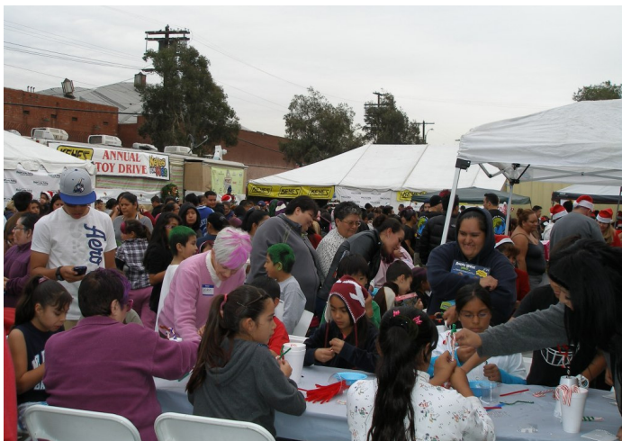
One slice of the whole event in full swing