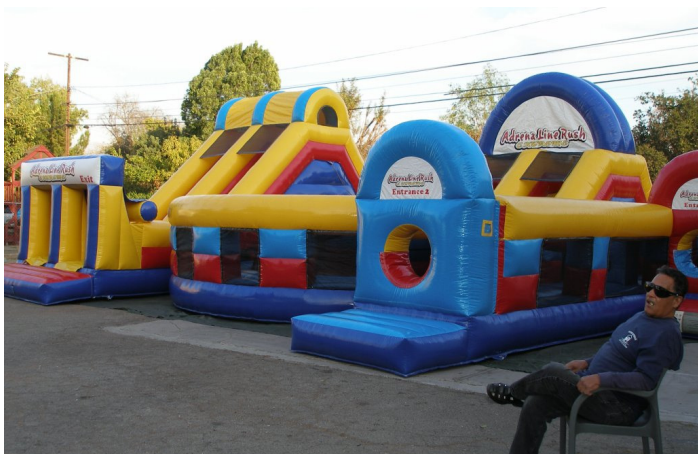
The Triple Bouncer