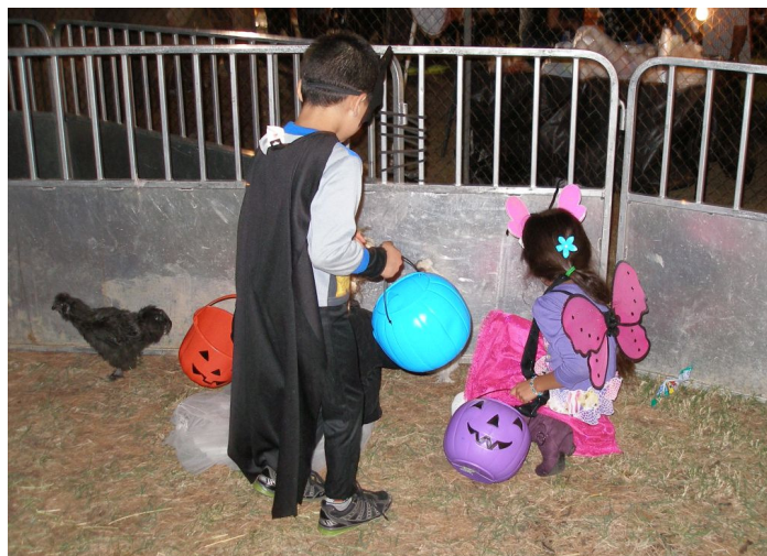
Two of our young guests in the petting zoo area