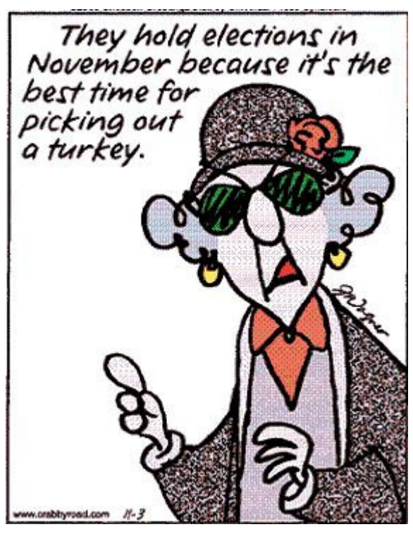
REMEMBER TO PICK YOURS - VOTE NOV. 6!