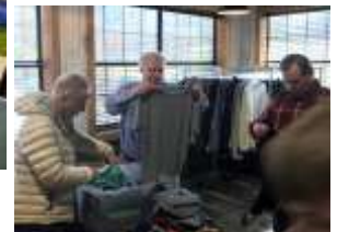
Distribution Night at Midwest—Rotaract & Rotary members working together!