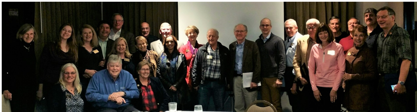
District Leadership Council quarterly meeting Dec 2016