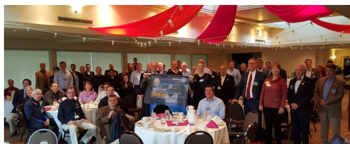
Bellevue Breakfast Rotary Club pledges to end Malaria by supporting The Rotarian Malaria Partners Pin Campaign