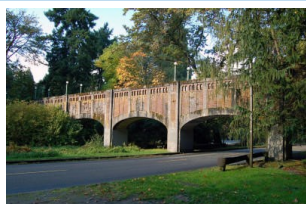
Arboretum Foot Bridge