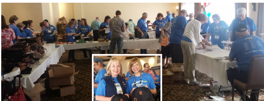
Connecting for Good by packing back packs for local Boys and Girls Clubs