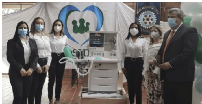
The HIDC has modern anesthesia equipment

Watch Video 1: https://www.youtube.com/watch?v=RKqfCnRhjS4&t=3s Watch Video 2: https://www.facebook.com/hidcese