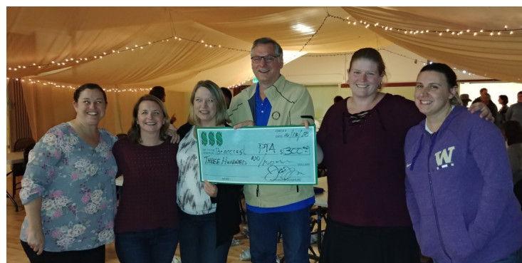
Do you folks want to find something really fun? I suggest attending a Bingo/Karaoke event sponsored by the Rotary Club of Seattle NE! Here I am presenting the winning pot to the PTSA of Briarcrest Elementary. Check out Seattle NE's website for the date of the next extravaganza!