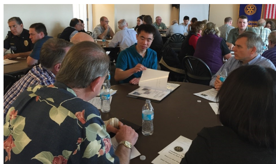
Issaquah Rotary Club hosting mock interviews with the Issaquah School District ACT students.