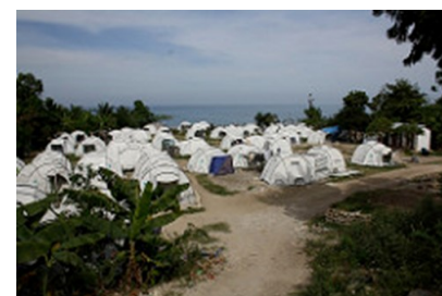
ShelterBox Tents – Haiti 2011

For club presentations please contact me at dave@disasterdave.com