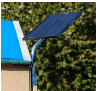
Installed solar panel