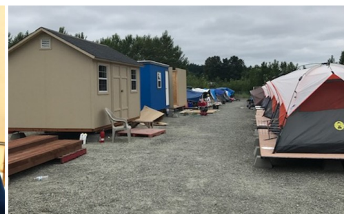
South Seattle Encampment. Being completed now with installing 10 solar units here this fall.