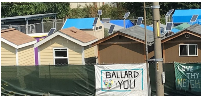
Completed project at Ballard encampment