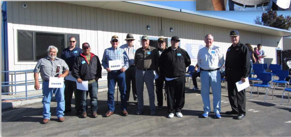
Noble Elementary Veterans Appreciation Day