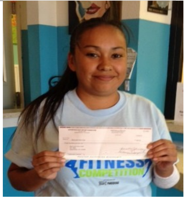
Halloween donation to Boys n Girls club.