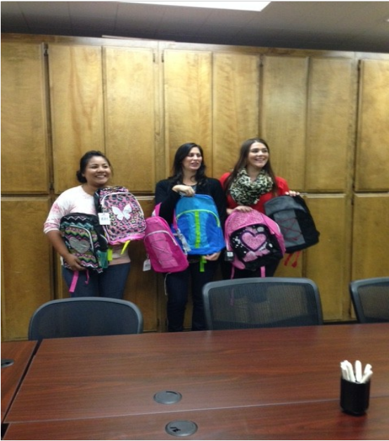
Backpack giveaway at Casa, for the Foster Youth.