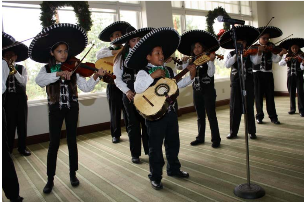
The 4th grader does not know how to speak Spanish, but has learned to sing it!