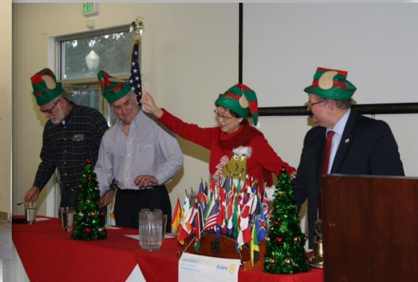
Misc. Photos of the afternoon. Thank you to all that contributed.