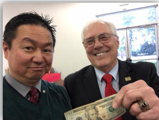
What is this? Our club President Elect Nominee already taking bribes?