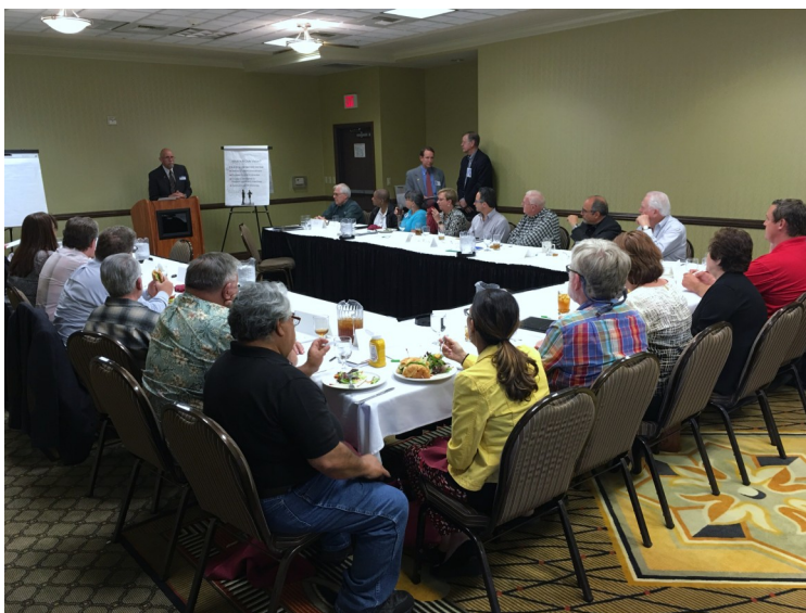
Rotarians at the 5-year planning meeting held at the Holiday Inn On April 26th.