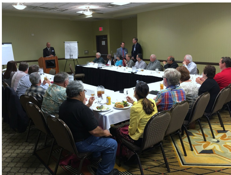
Rotarians at the 5-year planning meeting held at the Holiday Inn On April 26th.