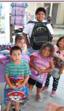
Douglas K. Fletcher Elementary