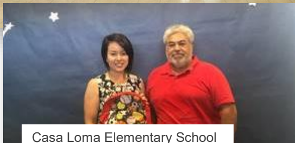
Casa Loma Elementary School