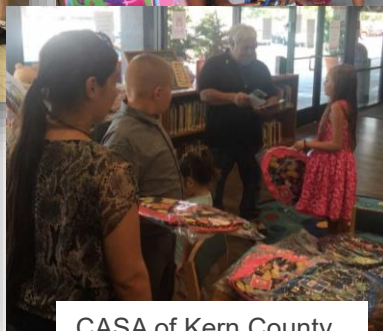
CASA of Kern County