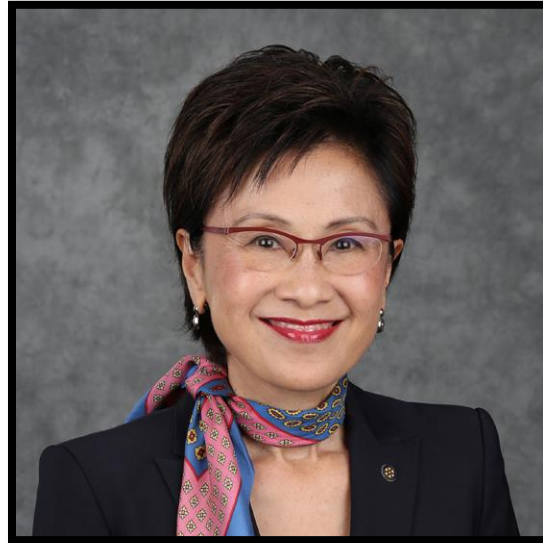
Mayor Karen Goh