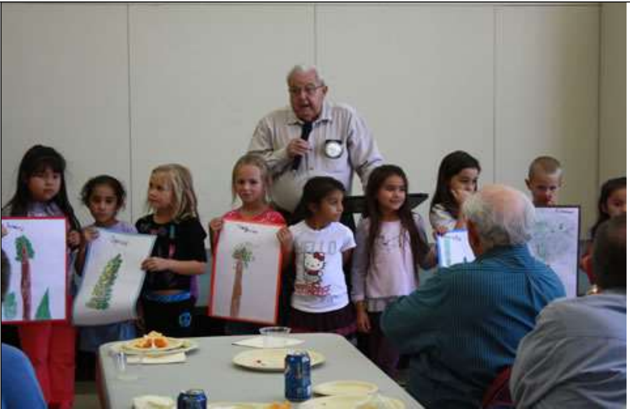
Completed: Arbor Day photo and article, Student of the Month