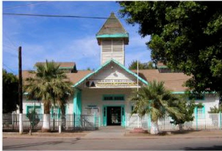
Santa Rosalia Biblioteca May 2004