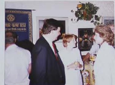
IT'S NO LAUGHING MATTER, THE HOTEL WILL OPEN BY AUGUST 1 st , IT'S JUST NOT CERTAIN WHAT YEAR.