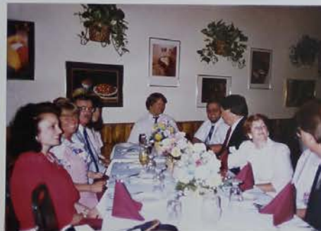
THIS GROUP JUST LEARNED ARTUROS WAS A CONTENDER FOR A MEETING PLACE.