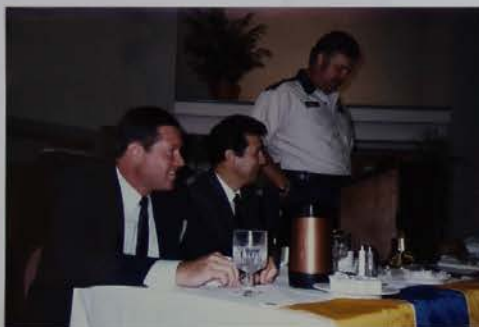
"SPECIAL GUESTS" OFTEN TAKE THEIR SEATS AT HEAD TABLE.