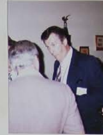
IF I HOLD MY CHIN LIKE THIS FOR 20 MINS A DAY, WILL MY BACK BE STRONGER?