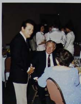
CRISTO REOR OTHASE