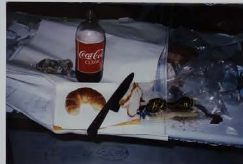
WITH GREAT GUSTO, CHEF ROYALE PREPARES THE CLUB'S FIRST GORMET MEAL!