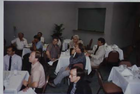
MEMBERS WATCH THE GOINGS-ON.