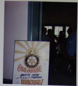
THE SIGN OF GOOD THINGS TO COME... Simi Sunrise .