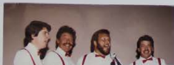
THE HARMONY OAKS QUARTET