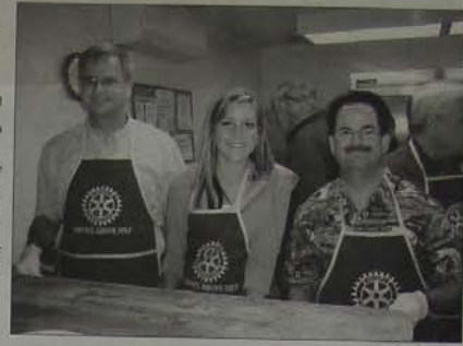
Rotary Club of Simi Sunrise Rotarians stand ready to serve a delicious Thanksgiving dinner to the community.