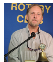
Minor in Partying