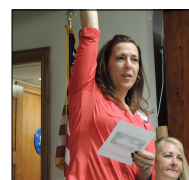
Prez to Be