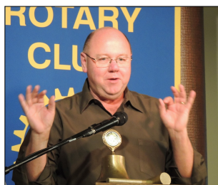
$7 and $2 Years of Wedded Bliss