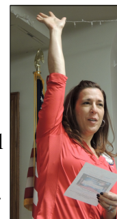
4th of July—Woo Hoo