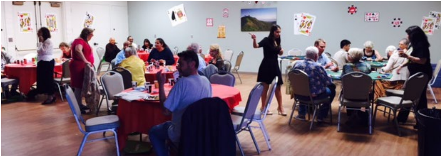
The Adult Center on the Westside sponsored a dinner cooked by our club members.