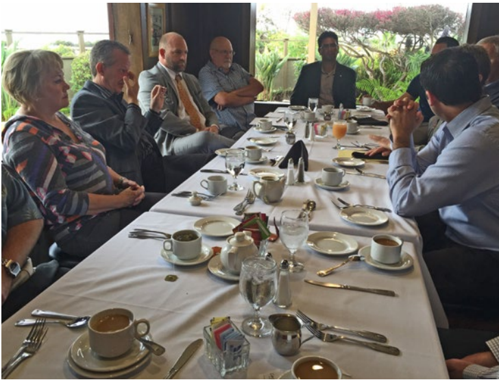
The Newcomer's Meeting is back up and running at the Pierpont Inn.