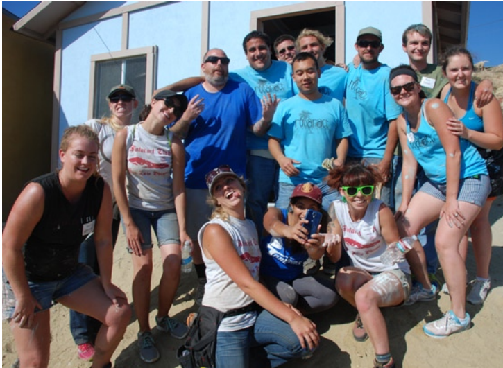
Ventura Rotaract, along with SLO Rotaract and members of Ventura Rotary, sponsored their fifth home build project with the organization Corazon to build a modest home in one day.