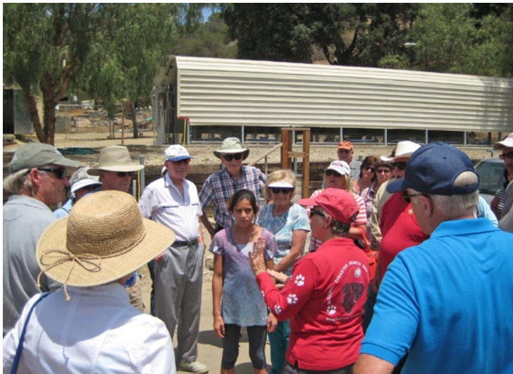
Rotarians are shown the kennels at the Rescue Center.