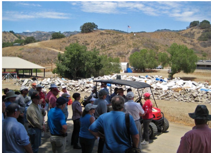
The pile of rubble helps search and rescue teams practice their life-saving techniques.