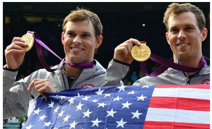
Bob and Mike Bryan, originally from Camarillo, have played the Ojai. Here they show off their 2012 Olympic gold medals in men's doubles from London.

And so, after 112 years, much has changed, and yet much remains the same. Thousands of spectators fill the Valley for five days to watch the finest in amateur tennis, enjoy fresh orange juice in the mornings, and tea and cookies in the afternoon, all provided by a tennis club that has no courts of its own and no paid employees.