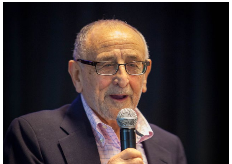
Ivor Davis shared 'road stories' from the legendary Beatles first US tour.