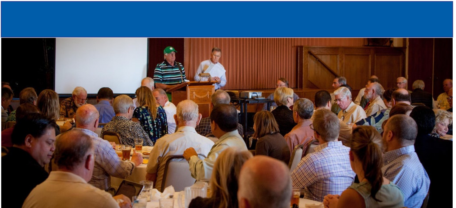
A full house of Rotarians from the three Ventura clubs watches announcements prior to the speaker's presentation.