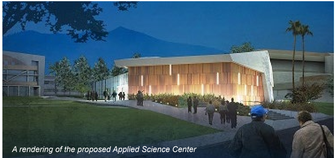
A rendering of the proposed Applied Science Center