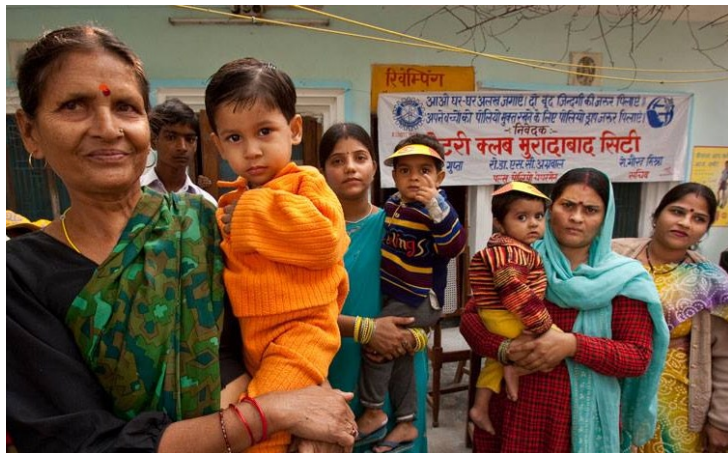
Mothers bring children to a Rotary booth during a polio Subnational Immunization Day in Uttar Pradesh, India.