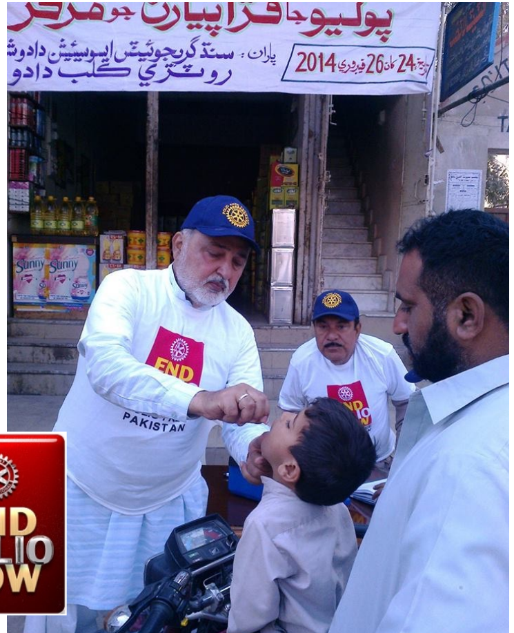
A Rotarian in Pakistan immunizes a child against polio as his father watches on during a national immunization day.