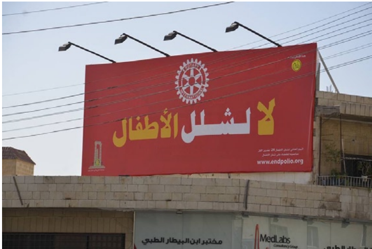
The End Polio Now message on display in Jordan. On March 2, Rotary International members will support immunization rounds in Jordan to help keep the country polio-free.