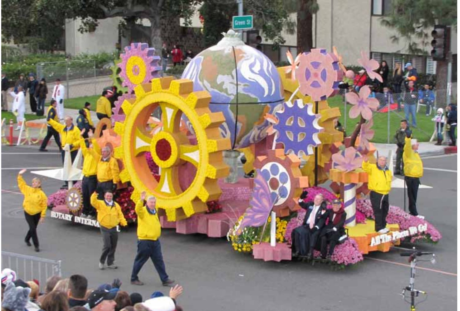
The Rotary International Float, entitled "All the Places We Go" makes its way down Colorado Blvd. in the 2013 Tournament of Roses Parade in Pasadena.