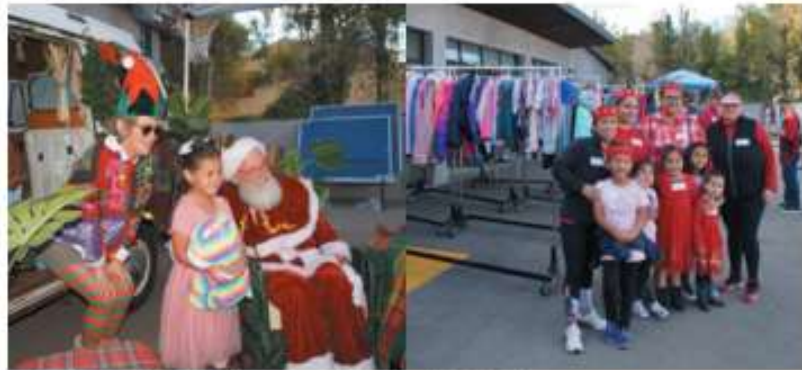
Approximately 500 children attended with their families.