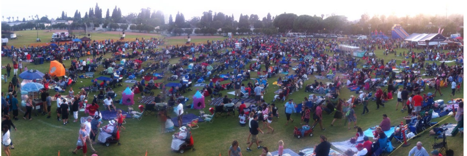
The crowds begin filling the field at Ventura College. Live music and a very popular Kid's Area kept the venue buzzing.