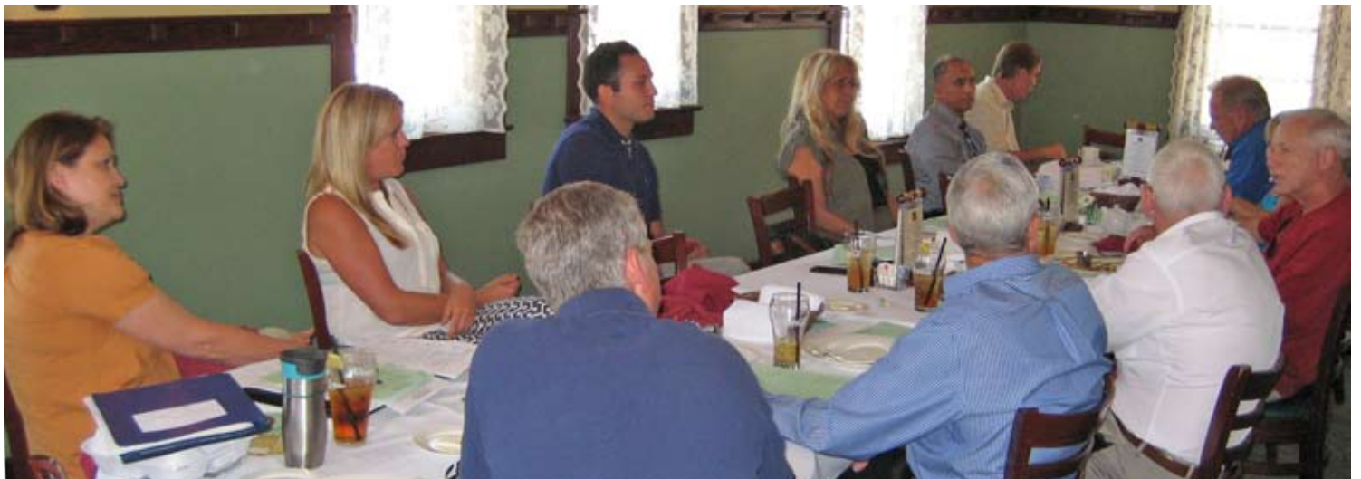
The Executive Board held their first meeting of the Rotary year, no doubt figuring out ways to make our Rotarian experience as wonderful as possible.