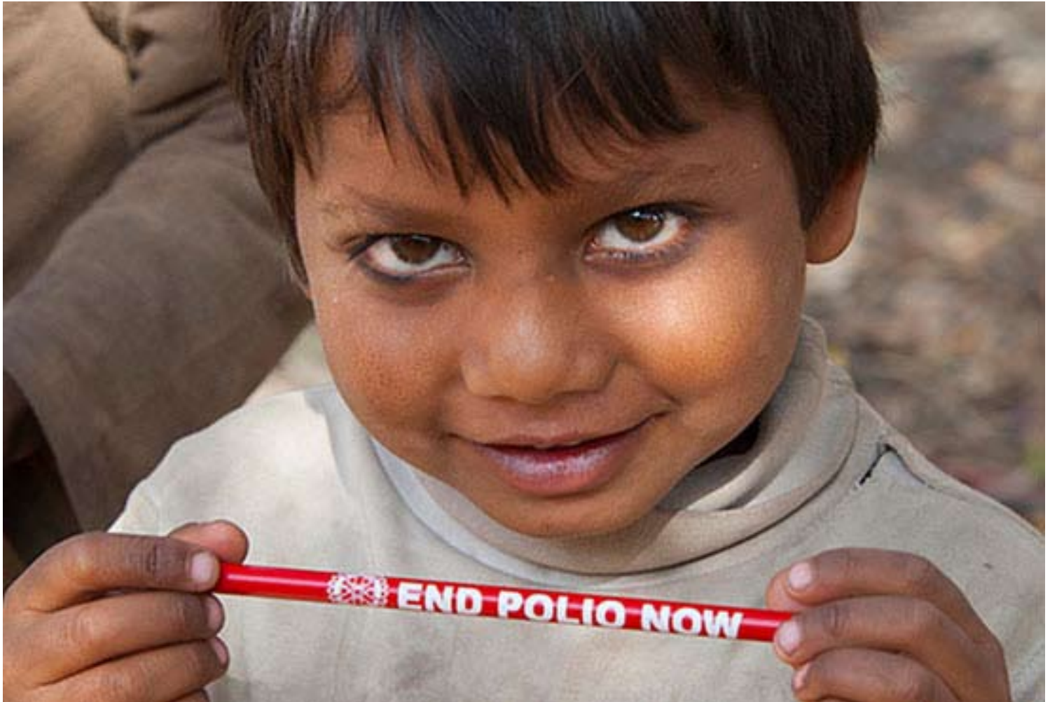
This image won honorable mention in the Rotary Photography Contest. It shows polio eradication in Sonipat, India. By Keith Marsh, Rotary E-Club of the Southwest, Arizona, USA