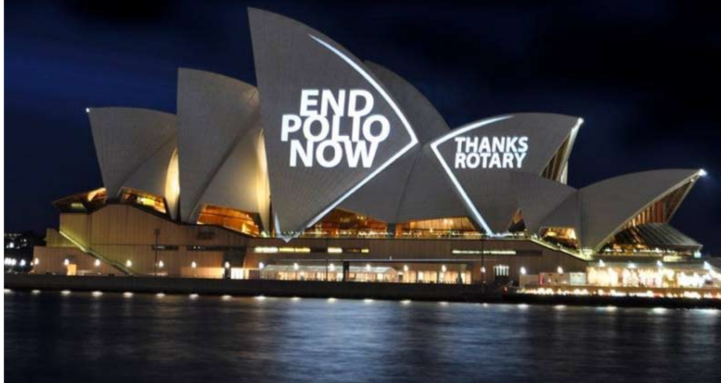
The 2014 Rotary International Convention will be held in Sydney, Australia.